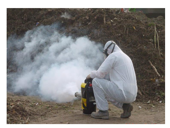
Figure 8: Thermal fogging at a green waste composting site

Some insecticides are approved for use as space sprays, where the liquid insecticide is atomised into very fine droplets that drift in the air and contact flying insects directly.