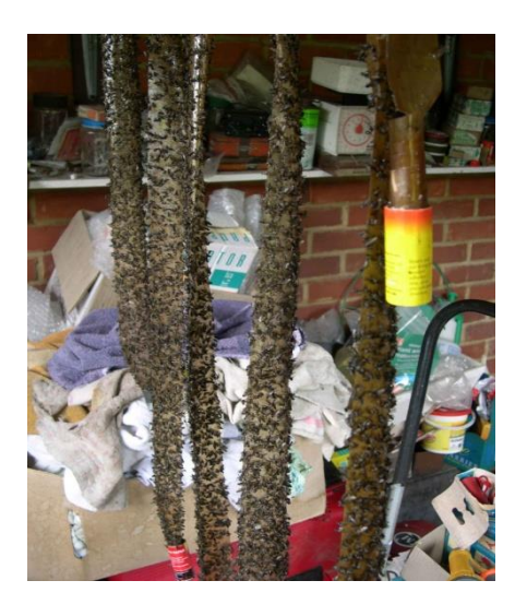
Figure 4: Adhesive fly papers in a resident's home

Traditionally, long adhesive fly papers are used, available from DIY or farm supply stores. They're cheap, easy to use and catch flies well, although they can be difficult to handle and store after use. Single-sided adhesive fly papers should be transported in cardboard boxes and can then be stuck on white paper to identify (where possible) and count flies.