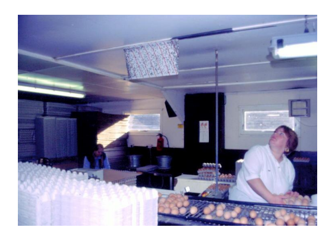
Figure 2: Adhesive fly paper used for fly monitoring in a poultry farm