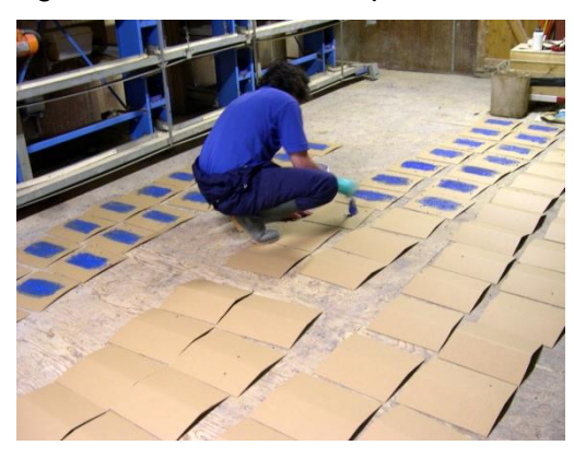
Figure 10: Preparing insecticide fly bait cards

Once applied, the bait will normally last some weeks or longer, but may need re-applying where large numbers of flies are present or if the bait becomes covered in dust or dirt.