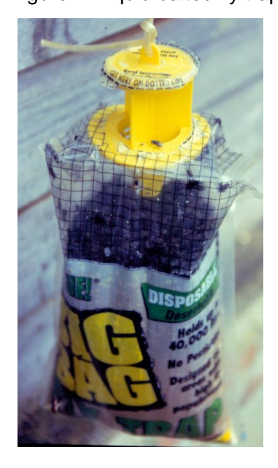
Figure 7: Liquid baited fly trap

Outdoors, liquid baited fly traps (Figure 7) are widely used in residents' gardens, for example.