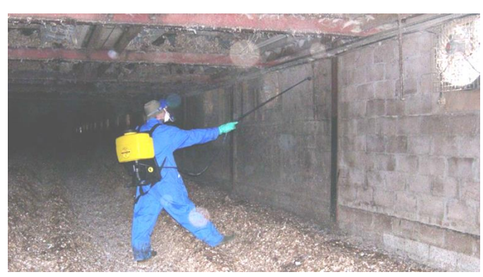
Figure 9: Applying residual insecticide for fly control

Some insecticides are intended for use as a residual spray and are applied to surfaces using a hand-held compression or pneumatic or motorised sprayer. They leave a deposit that remains active for some days or weeks. Flies that subsequently alight on the treated surface pick up a lethal dose of the insecticide and are killed. They typically contain residual pyrethroids or a carbamate. Residual insecticides are seldom applied to manure, as they will kill the beneficial (insects and mites). However they may be applied to waste in transfer stations or landfill sites. Waste that has been turned may need to be re-treated. In animal husbandry the structural surfaces should be sprayed but not the manure. In waste facilities however, spray can be applied to surfaces and to the waste itself.